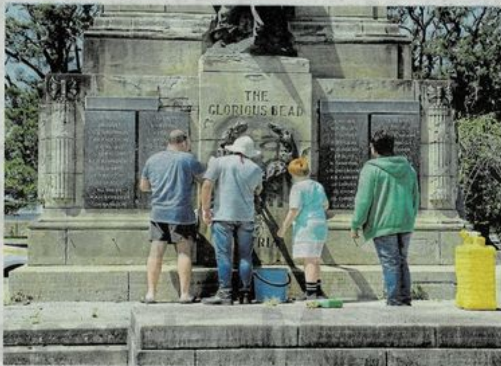
GLORIOUS DEED: Members of the EL Caledonian Society Pipe Band helped clean up the Oxford St war memorial over the weekend

When the GO! visited again last weekend, members of the Pipe Band were busy scrubbing